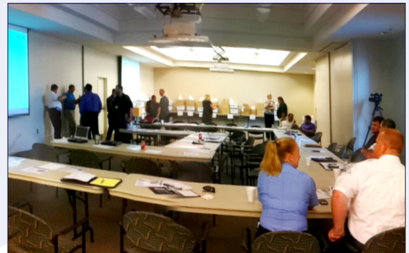
AVLS orientation and equipment deployment, August 5, 2011, Atlanta

In Motion Technology Inc. staff conducted the training portion of the meetings, which was well-received by participants. Likewise, equipment distribution